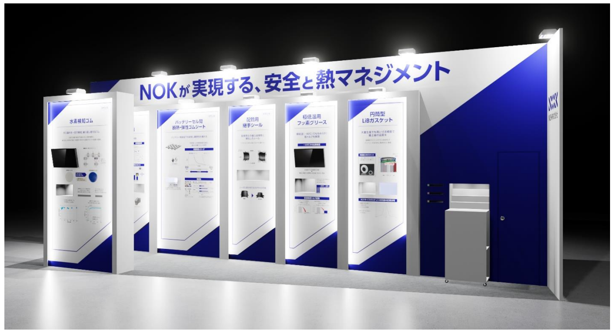
NOK Group booth design

With its philosophy of "Essential Core Manufacturing – The manufacture of pivotal products that shape society," the NOK Group is committed to developing innovative solutions that enhance safety and efficiency across industries. At this exhibition, NOK will introduce a range of products designed to improve battery safety and thermal management. These include pressure control valves that regulate gas release within battery cases and insulating heat-conductive resins that aid in heat dissipation. NOK will also showcase its newly developed "Hydrogen Detection Rubber," created in collaboration with Tokyo University of Science. This innovative material changes color upon exposure to hydrogen gas, providing a simple yet effective way to detect leaks and enhance the safety of hydrogen-use environments.