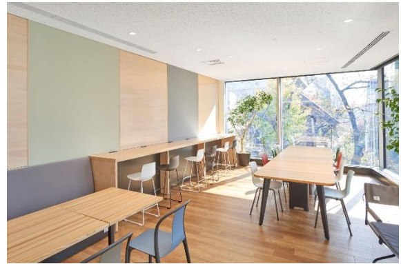
Lounge with extensive use of wood