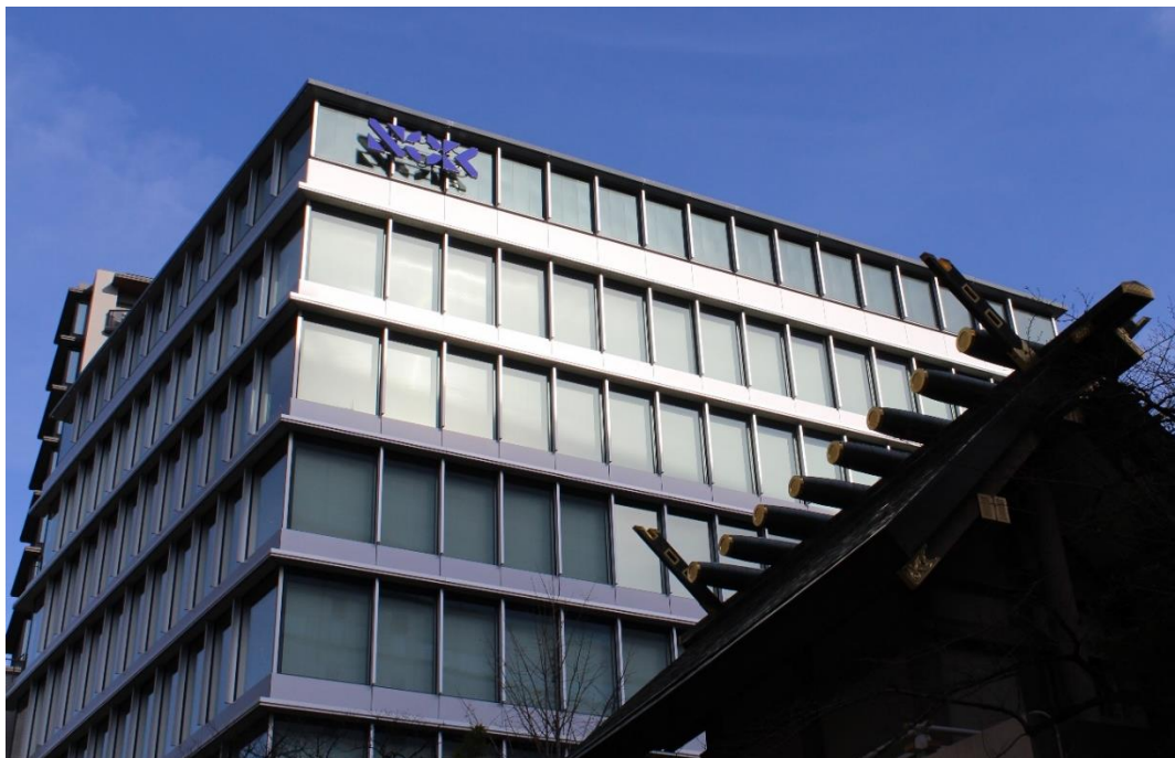
NOK Headquarters Building

The ICONIC AWARDS is a prestigious international accolade recognizing outstanding design. The NOK Headquarters Building was honored with this award for its consistently high-level concept and meticulous attention to detail from the design phase through to completion.