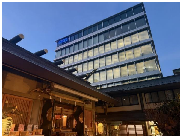
The NOK Headquarters Building as seen from the neighboring Shiba Daijingu Shrine