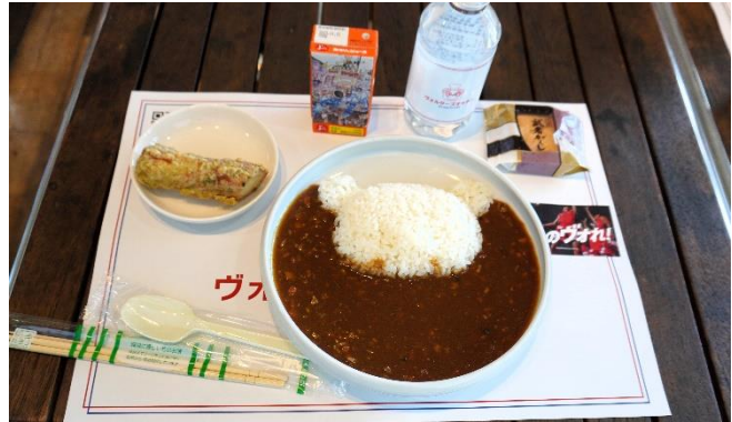
Curry rice made with freshly harvested rice from the Rice Paddy Owner Program