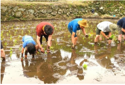
Rice planting in June 2024