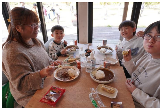
At VOLTERS KITCHEN, children enjoyed curry rice made with freshly harvested rice.

With its Kumamoto Plant located in Aso City, Kumamoto Prefecture, NOK has been a proud supporter of the Kumamoto Volters since 2019. By introducing children to the joy of sports and fostering enthusiasm for local teams, NOK aims to deepen their connection to the region. In collaboration with the Kumamoto Volters, NOK has undertaken various initiatives.