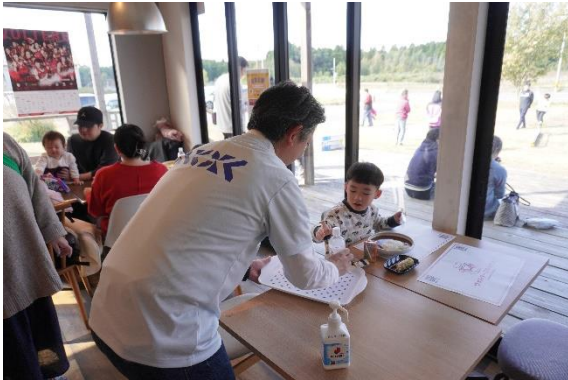
NOK employees also provide support

The VOLTERS KITCHEN events on Sunday, November 17, and Saturday, December 7, welcomed over 200 children and their families. This time, the menu featured curry rice and a selection of sweets, offering a satisfying and enjoyable meal. Participants were delighted to learn that the rice used in the curry was locally grown and freshly harvested. Many shared their impressions, saying, "The rice is glossy and delicious" and "It has a wonderful aroma and a fluffy texture." The meal provided a memorable and fulfilling dining experience, showcasing the unique flavors of fresh rice.