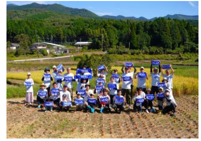
Participants in the 2024 Rice Paddy Owner Program rice harvest

For inquiries related to this press release: