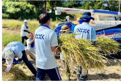
Rice harvesting in October 2024