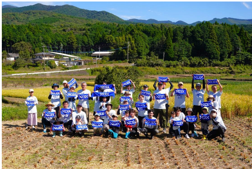
Participants in the 2024 Rice Paddy Owner Program rice harvest