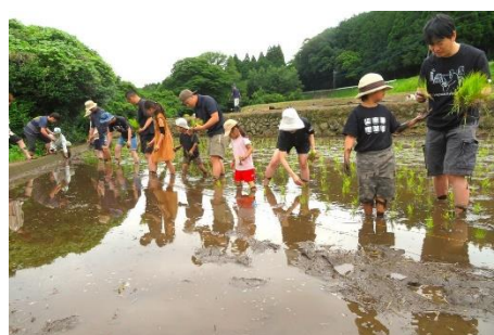
Rice planting held in June